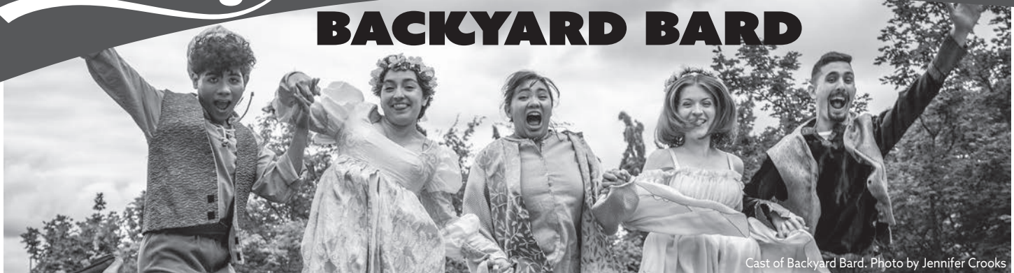
Cast of Backyard Bard.